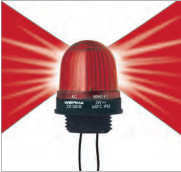
Mainly sideways illumination